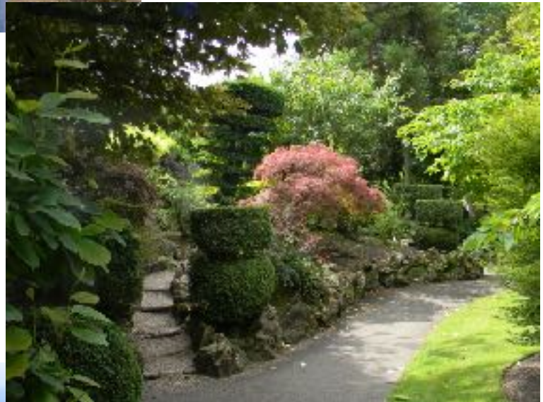
She did take time away from the horses to admire the lovely gardens at the stud farm.