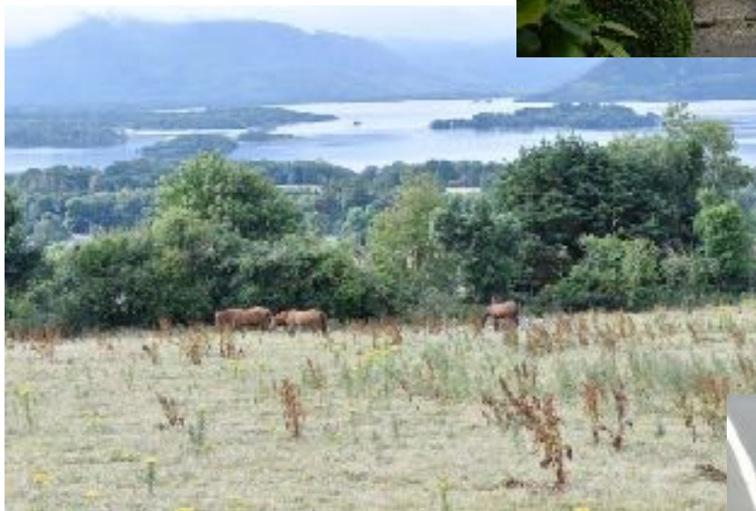
These Irish horses certainly have scenic views while they graze.