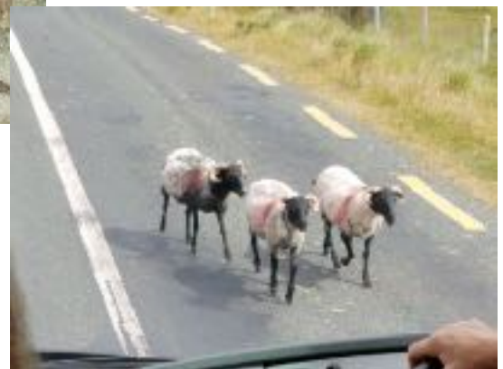
Three bold Irish sheep seem to think they have the right of way.